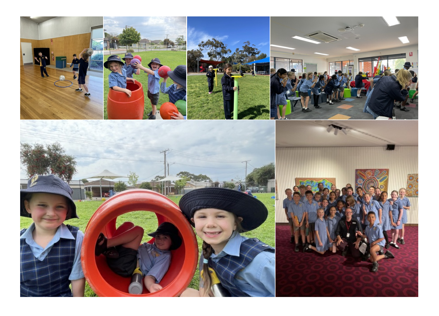
TERM 4 - Lunchtime Activites

We have some great weather for outdoor activities in PE coming in term 4 and games like Tee Ball and Tennis are sure to be seen on the oval and courts. Summer time games are fantastic for small ball coordination development activities. We have one SACPSSA Carnival remaining for 2023 which is Athletics. This carnival features a small selected team from years 3,4,5 and 6 and take place at SANTOS Stadium in week 4. Enjoy the sunshine!