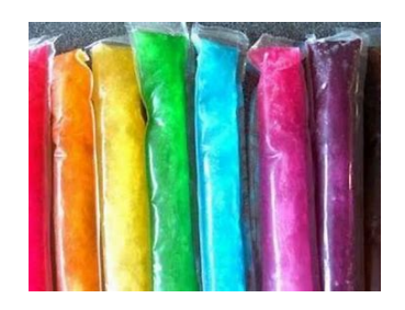
Ice blocks are back in Term 4.