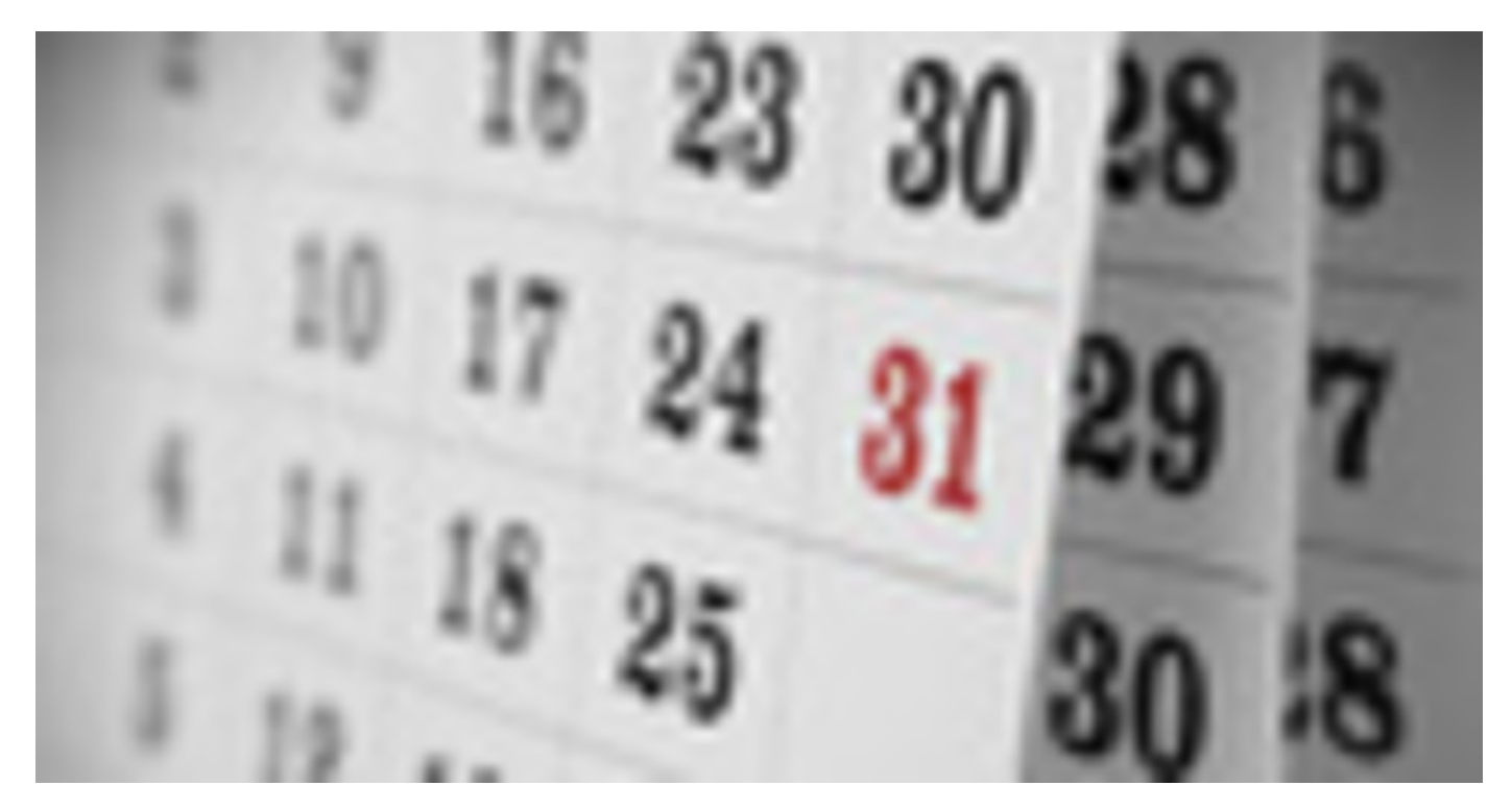
CTK School Calendar can now be accessed through the SkoolBag App.

Click to download instructions on how to install Skoolbag